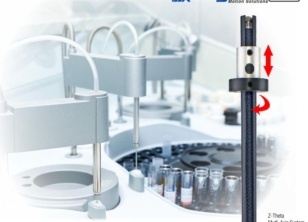
Z-Theta Multi-Axis System

The highly configurable Z-Theta provides flexibility, value, durability and performance suited for a host of lab automation, semiconductor and light factory automation applications. Performance is customized through a variety of leadscrew resolutions, available free-wheeling and anti-backlash nut selections, stepper motor configuration options, and optical encoder line counts.